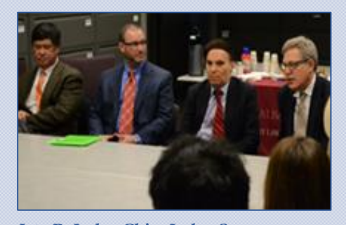
L to R: Judge Chin, Judge Sagerman, Judge Katzman, Judge Weisel

A new immigration initiative by Albany Law School's Clinic & Justice Center brought four federal judges onto the campus to meet with students and faculty and discuss the current issues students may face working in immigration law. The new program, called the Immigrant's Rights Initiative, offers a field placement for second- or third-year students to directly represent immigrants facing removal