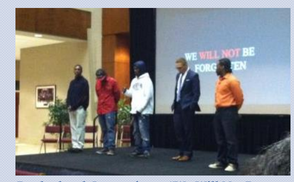
Brotherhood, Inc. performs "We Will Not Be Forgotten" Friday, November 1, 2013

The University of St. Thomas Interprofessional Center for Counseling and Legal Services hosted the 28th Annual Midwest Clinical Conference, Harnessing the Storm: Creative Responses to the "New Normal" from November 1-2. The conference, with over 80 clinicians in attendance from across the country, proved thought-provoking, encouraged the formal and informal exchange of teaching and mentoring ideas and fostered new and existing relationships between attendees. Video of the plenary sessions and our keynote given by Judge